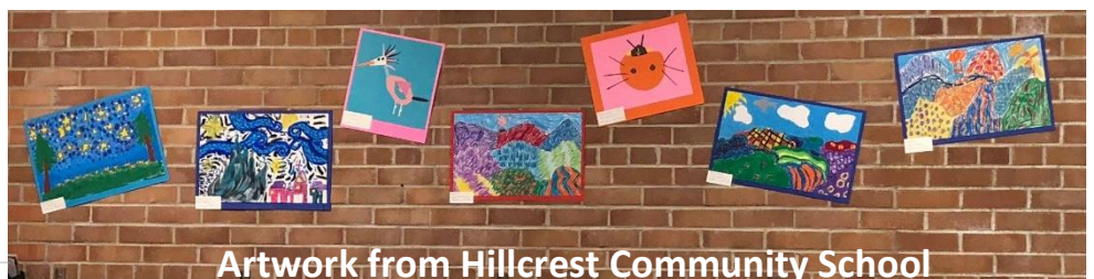
Artwork from Hillcrest Community School