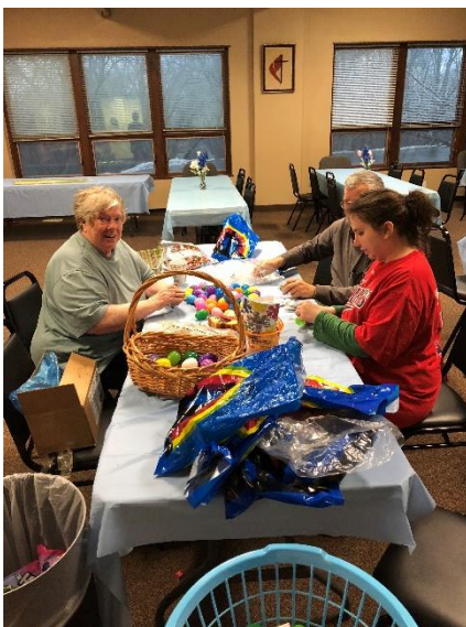
Making Easter Baskets