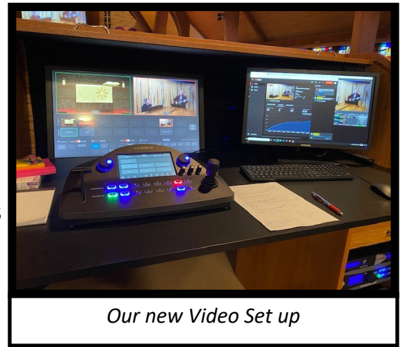
Our new Video Set up

Thanks to Kaite for the help running the cameras during the service. We're both continuing to learn and improve the audio / video aspects of the service, we have been blessed that our first few weeks have been relatively smooth! You may notice the picture looks a bit "grainy" - this is due to the lighting in the worship space. The cameras are compensating for the low light to make the images as bright as possible but this compromises some of the quality.