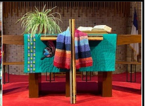
Blessing our Prayer Shawls